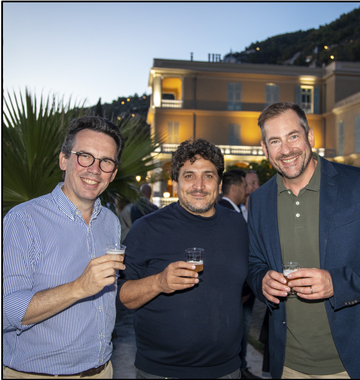
Mauro Colagreco- 3* Michelin Chef